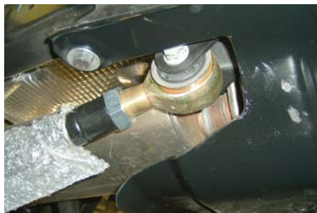
Typical skid plate modifications necessary on '03-current vehicles.