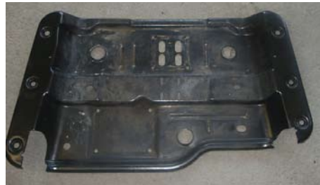
Typical skid plate modifications necessary on '97-'02 vehicles.

gram 1). Trim the plate and place the brackets and arms on top to be sure there is enough clearance, cycle the arms through it's full range of movement to make sure that enough material is removed from the skid plate.